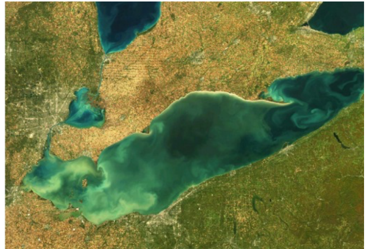
Lake Erie algal blooms.