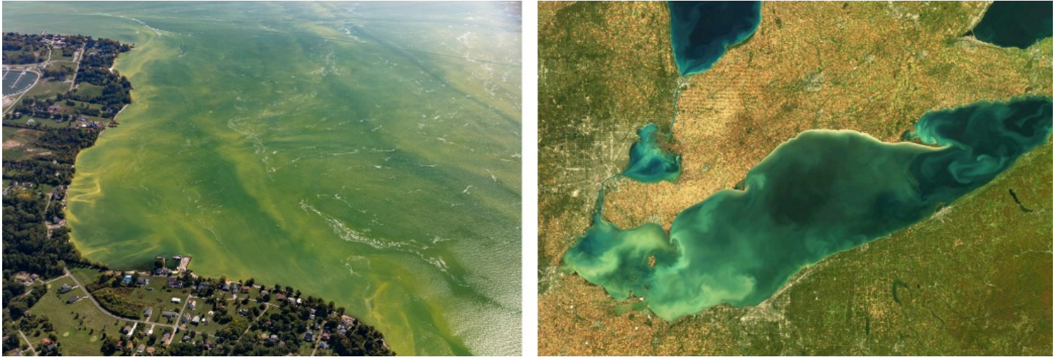
Lake Erie algal blooms.