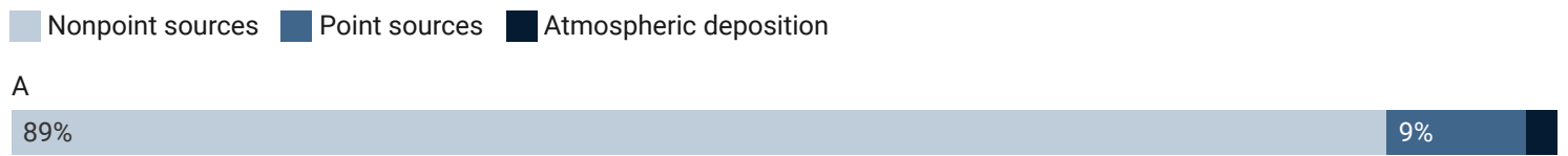
Chart: Center for American Progress • Source: Source: U.S. Environmental Protection Agency, “U.S. Action Plan for Lake Erie” (Washington: 2018), available at https://www.epa.gov/sites/production/files/2018-03/documents/us_dap_final_march_1.pdf .